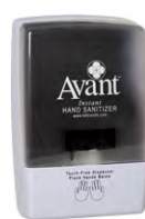
Touch-Free Dispenser (9370)