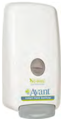
1000 mL Manual Wall Dispenser (9350)