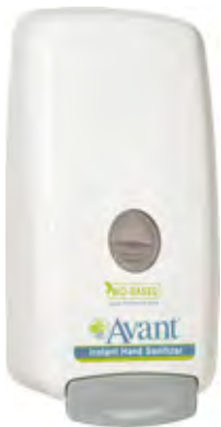
1000 mL Manual Wall Dispenser (9350)