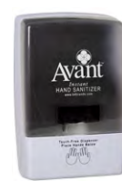
Touch-Free Dispenser (9370)

The Environmental Choice in Hand Hygiene